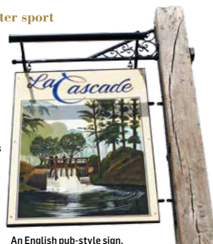
An English pub-style sign.

The fishing itself is classic dry fly with plenty of rainbows and some browns to 6lb taken off the top to Sedge, CDC and Bob's Bits. Small weighted nymphs also take their share and the fish fight extremely well due to the cool water supply from subsurface