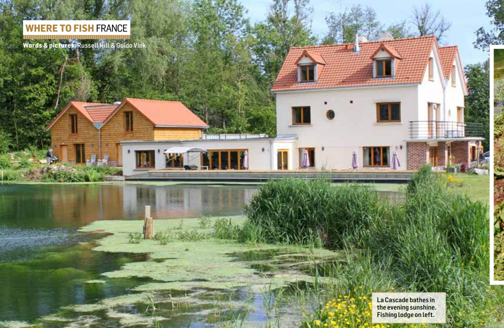
La Cascade bathes in the evening sunshine. Fishing lodge on left.