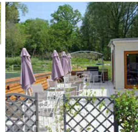
Enjoy a drink outside by the water in summer.