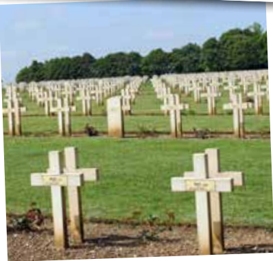
The graves of French servicemen.