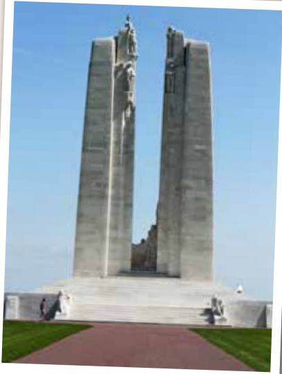
Canadian National Vimy Memorial.

The small market towns of Avesnes-Le-Comte, Saint-Pol-sur-Ternoise and Frévent are within easy reach. The beautiful city of Arras is a 30 minutes' drive, Louvre Lens 35 minutes, Amiens 40 minutes, and Lille and Le Touquet 50 minutes. Close to many WWI sites including Thiepval and Vimy Ridge.