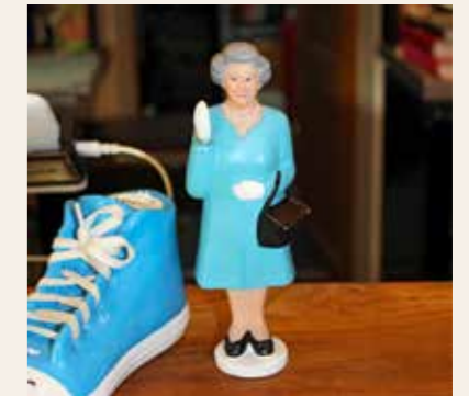
Britain's Queen waves from the bar.