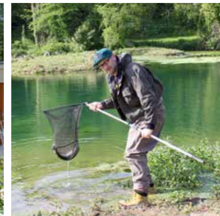
The restaurant will cook your catch on request.